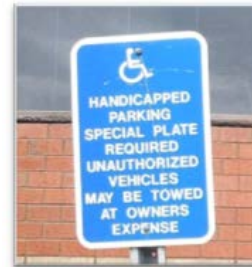
Fig. 2 Input Image

Consider an image as shown in Fig. 2 contains some text in foreground and background contains some unwanted things. Every region can be filtered with different colors from 0 to 255. The main use of the canny is to remove on-text regions from the input image the canny edge detection we have to separate the letters from the background and many of the non-text regions have been separate from text. Now the filtering is to remove some of the connected components busing their region properties shown in Fig.3.