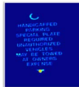
Fig. 5 Visualization of Text with Stroke width

Once all the potential lines are detected, a procedure to apply a threshold is performed to obtain a possible line