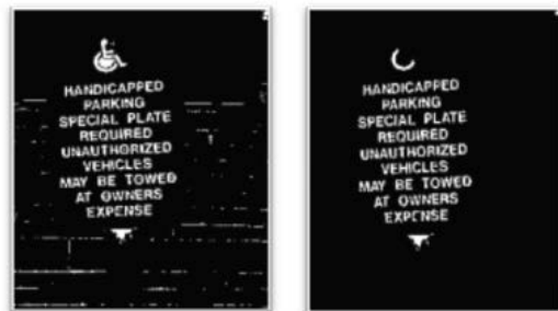
Fig.4. Text Before and after Region Filtering