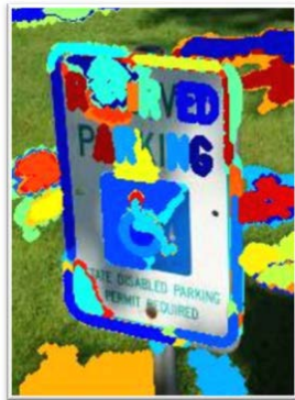
Fig.1 Region identification by edge detection

as a weak edge pixel. The strong edge pixels should certainly be involved in the final edge image, as they are extracted from the true edges in the image. However, there will be some debate on the weak edge pixels, as these pixels can either be extracted from the true edge or the noise /color variations to achieve an accurate result, the weak edges caused by the latter reasons should be removed. Usually a weak edge pixel caused from the true edge will be connected to a strong edge pixel while noise response are unconnected to track the edge connection, blob analysis is applied by looking at a weak edge pixel and its 8-connected neighborhood pixels as long as there is one strong edge pixel that is involved in the blob, that weak edge point can be identified as one that should be preserved.