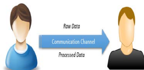
Fig. 1 Communication Channel