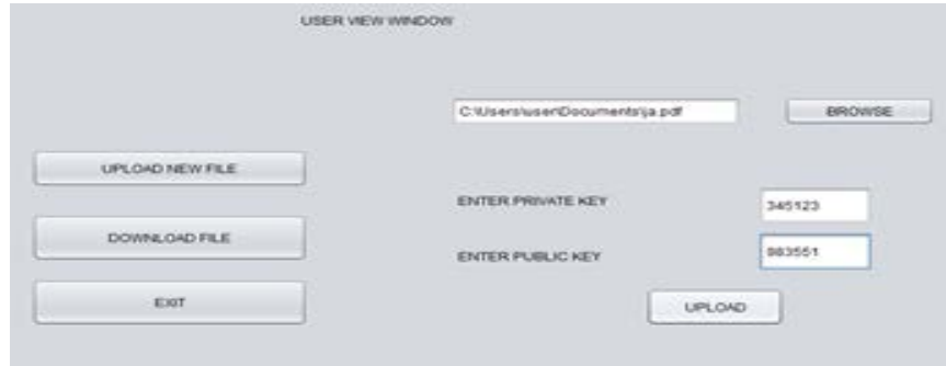
Fig. 2 Data encryption process

cloud network has been focussed intently. The scheme uses cryptographic measure using DES block cipher security algorithm which has been combined with the firefly optimization process.