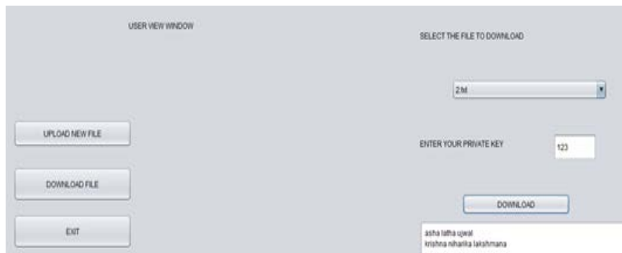
Fig. 3 Data decryption process

involves DES algorithm along with firefly encryption process which includes key optimization algorithm for security and confidentiality.