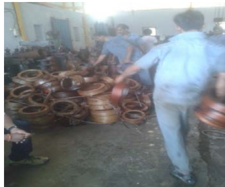
Fig. 4 Damage coil inspection and scrap