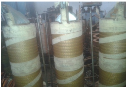
Fig. 2 LV Coil Inspection

It is compulsory to lock transformer with a seal by the concern authority before sending transformer at repairing company. This may protect the transformer to attain any unauthentic operation. Check oil of all transformers by the repairing engineer in the presence of inspection team. This is also verified with the External inspection report. External inspection carried out again for verifying. Then dismantle all transformers to be inspecting of internal inspection. All HV Damage coils must be impaired by the repairing engineer in the presence of the inspection team. This may avoid reprocess of the damaged HV coil. The weight of the coil should be measured very carefully as it increases the cost of repairing.