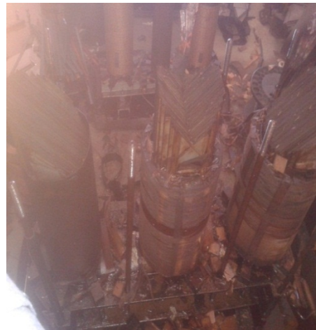
Fig. 6 Core damaged for scrap

[Figure. 2, 3, 4, 5 and 6 Source: 1. DGVCL Failed Distribution transformer-Distribution company 2. Trans Electro Valsad-Repairing Company 3. Ashish Electrical Vapi-Repairing Company]