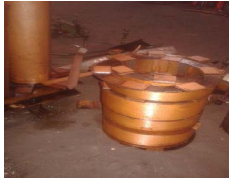
Fig. 5 HV Coil Separation for weight