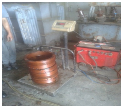
Fig. 3 HV Coil inspection for damage and weight.