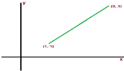
Fig.2 To calculate distance (b)